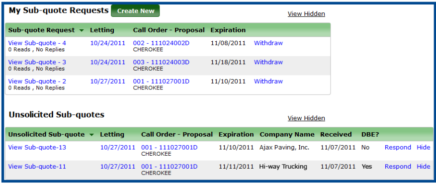
Small Business Network tab home screen, prime contractor view

After logging into the Bid Express service, you can quickly review all of your subquote requests and all unsolicited subquote requests from subcontractors. To simplify the Small Business Network home screen, sub-quote requests can be hidden with one click if they are not applicable.