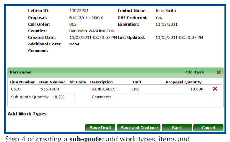
comments, and modify quantities.